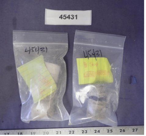
Figure 1: Sample, as received